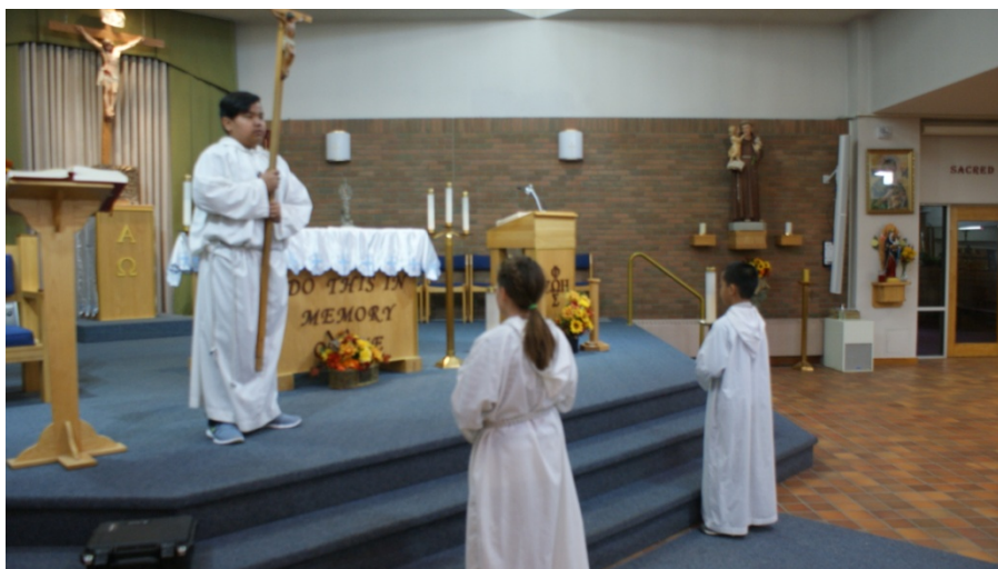
Fig. 3 – Arrival at the Sanctuary

When you genuflect, your right knee should touch the ground.