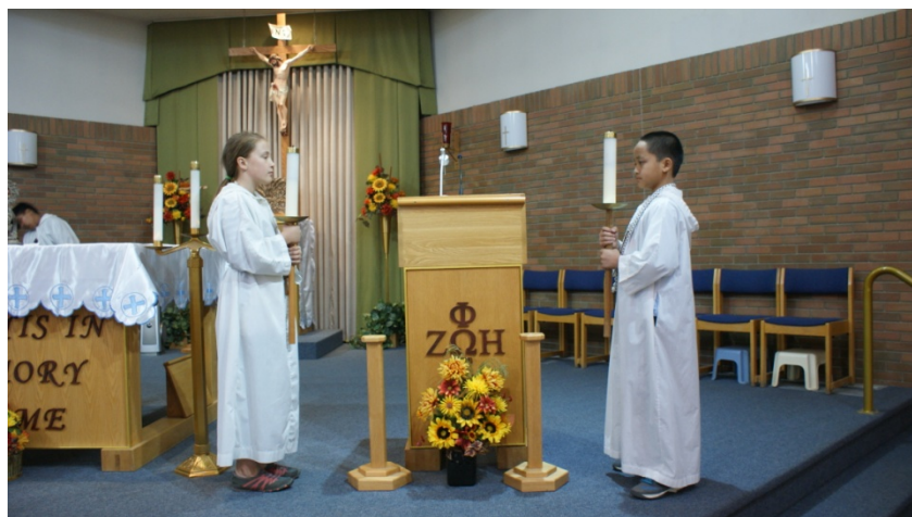
Fig. 4 – Holding the candles for the Gospel reading

Remember: You do not need to make the sign of the cross on your forehead, lips and heart when holding the candles. Candle Bearers should take care while they are genuflecting or bowing, to not tip the candles.