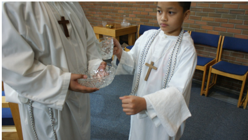
Fig. 5 – Holding the bowl, cruet and towel for the washing of hands